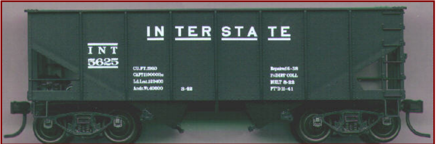
AccuRail 2500 Series Interstate Coal Hopper