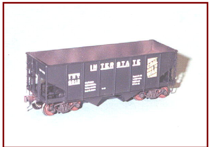
Interstate Hopper with "Coal Goes To War" Slogan

200 pcs. @ $9.98/each without the yellow printing hit (3 road numbers).