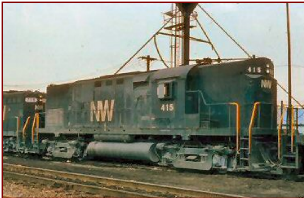
N&W ALCo C420 #415

The ALCO Century 420 was a four-axle, 2000 horsepower (1.5 MW) diesel locomotive of the road switcher type. 131 were built between June 1963 and August 1968. Cataloged as a part of ALCO's "Century" line of locomotives, the C420 was intended to replace the earlier RS-32 model. Since 2005, roughly 30% of C420 production exists. All units ordered by Mississippi State Export, New York, Chicago & St. Louis Railroad ("Nickel Plate"), and Piedmont & Northern Railway have been scrapped. The two units delivered to the Piedmont & Northern were the first of the Phase II units.