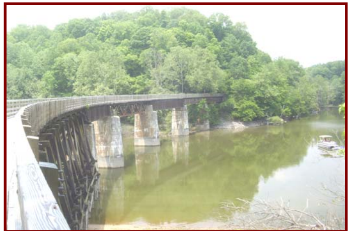
Top to Bottom: Damascus, Green Cove, Right-Of-Way, Bridge, Low-boy Trestle; Holston River Bridge