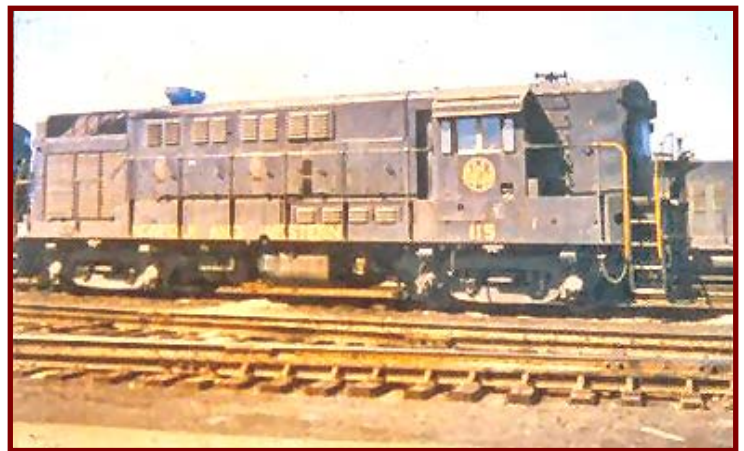
FM H16-44 No 115 Ex-VGN No. 15