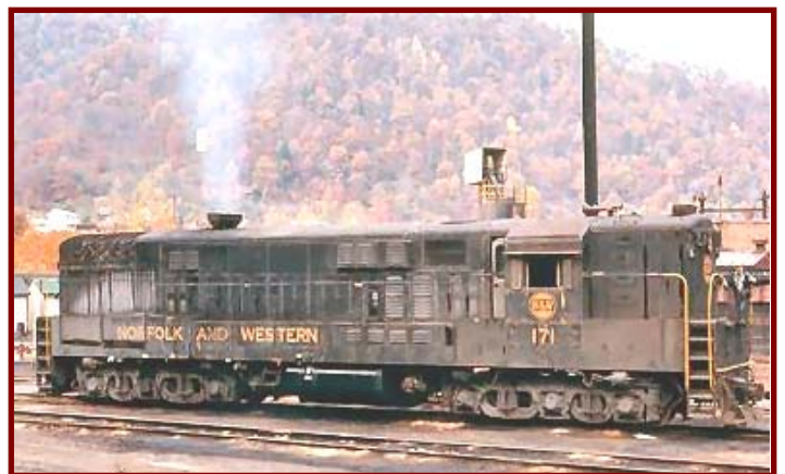
FM H24-66 No 171 Ex-VGN No 71

The Norfolk & Western inherited a rag-tag motley collection of Fairbanks-Morris units through mergers with the P&WV (Pittsburgh & West Virginia), the Virginian Railway, the Nickel Plate and the Wabash. Models included ALT 100 6a's, ALT 200 1a, H12-44, H16-44, H20-44 and H24-66. The earliest units were purchased in 1946 immediately after the war when Fairbanks-Morris tried unsuccessfully to reenter the Diesel locomotive market. The final units were purchased 1958 towards the end of Fairbanks-Morris's diesel production run.