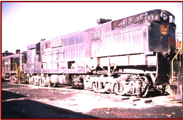
FM H24-66 No. 174 (ex VGN 74) at Roanoke, VA., in a wrecked condition.