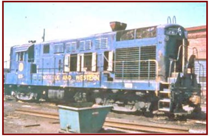
FM ALT 100.6A Ex-NKP No. 125 renumbered N&W No 2125