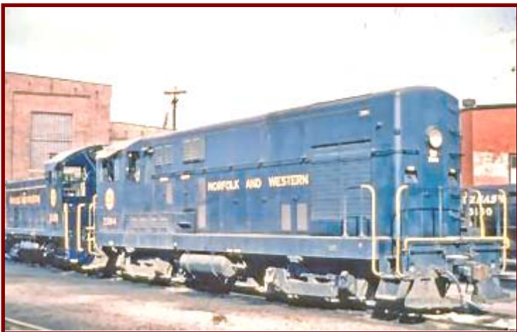
FM H12-44 Ex-NKP #3517