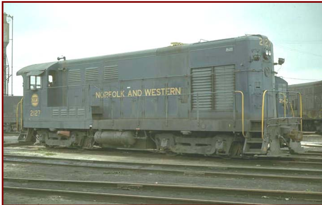
FM Alt 100.6a No. 2127 (ex NKP127), at Brewster, Ohio.