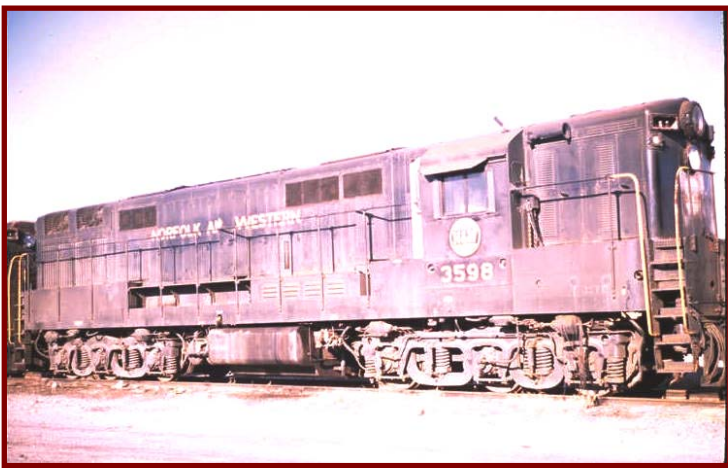
FM H24-66 No. 3598 (ex WAB598) at Bellevue, OH. This unit was repowered by Alco.